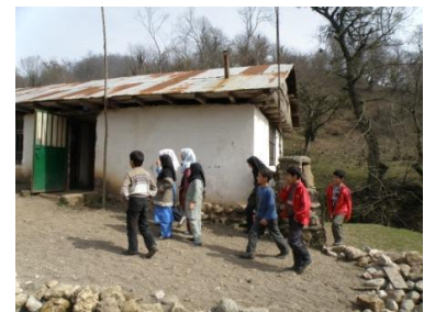
school without toilet

Mahatma Gandhi “Sanitation is more important than independence”