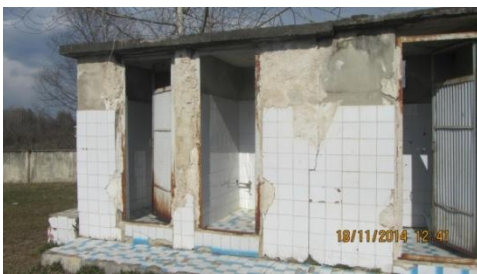
Situation of toilets in many schools

In this very beautiful region we have a lot of problems in sanitation and many people live in below of poverty line